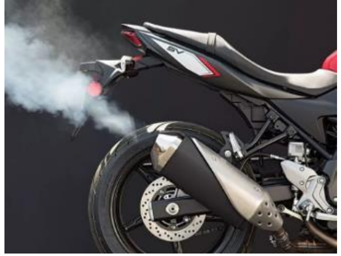
Despite MAG explaining that powered twowheelers (PTW's) are part of the solution to pollution and congestion problems, a recent newspaper article says bikes are to blame! Since 2010, levels of fine particulate pollution from London traffic have dropped at only a quarter of the

rate in Paris. In the same period there has been an 11 per cent year-on-year increase in the use of motorcycles in the city, leading some academics to assume that the bikes must be the cause.