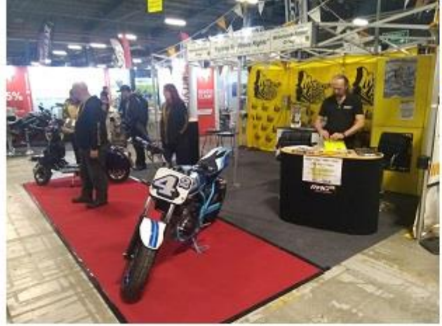
As always, MAG gives every member the red carpet treatment!

The general feedback was that the Manchester Bike Show at Event City was better than last year. The MAG stand was there both days and there was a constant stream of members, new and old, calling in to say Hi. As ever, we're always chuffed with the level of encouragement we get. Here are some interesting machines at the show: