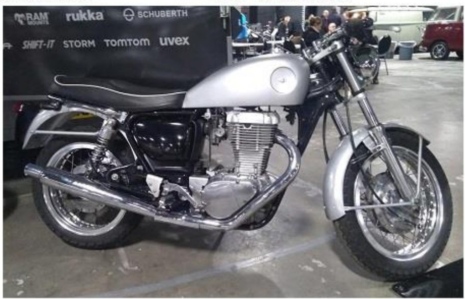
What do you do if you really want a BSA Gold Star but all you've got is a Suzuki LS650 Savage? It's work in progress but looking mighty good.