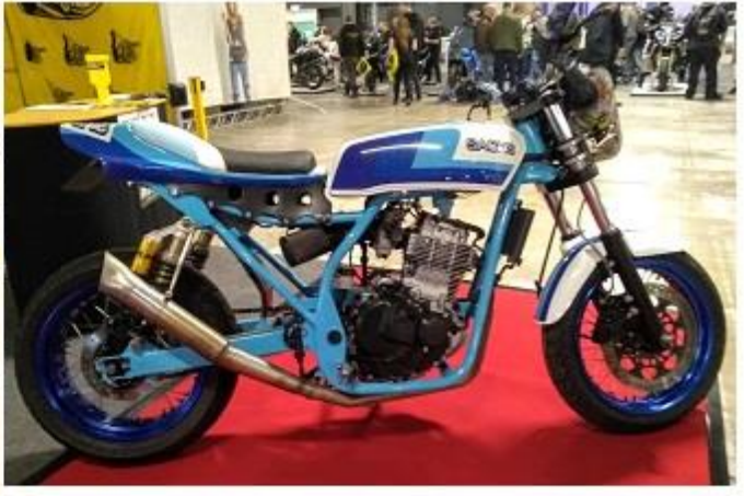
Grobo from Blackpool MAG's latest creation shows that you can make a thing of beauty from the ugliest donor bike (Sachs 650 Roadster)