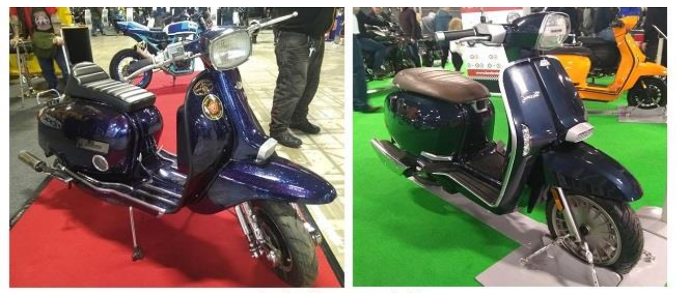
Lambrettas, new and old.