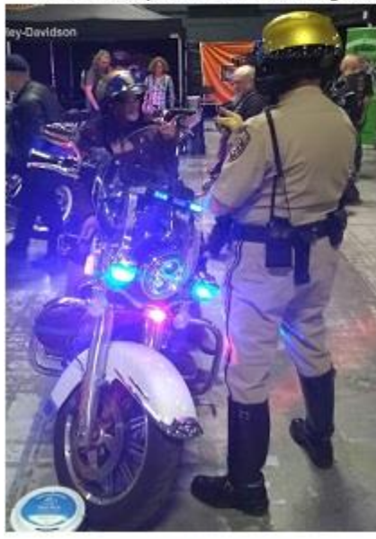
CHiPs with everything.