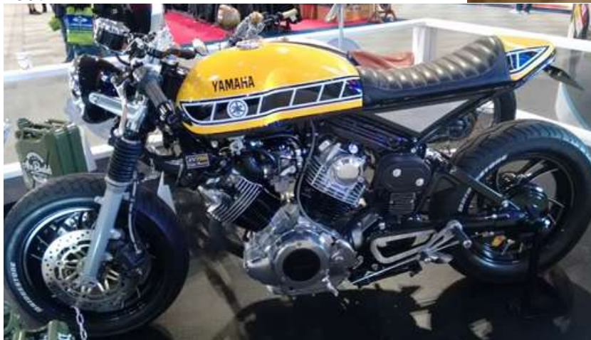
It may not be the fastest café racer on the road but it's still an interesting home for a Virago 1100 engine.