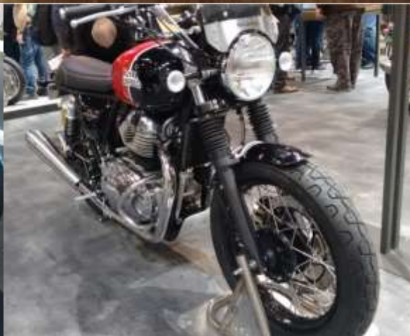
If retro twins float your boat then the new Royal Enfield Interceptor may be for you.