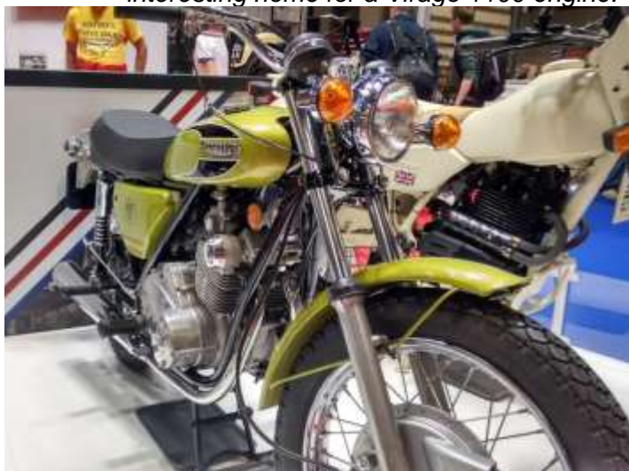
Is this the bike that could have saved the British Bike Industry? This 1971 Triumph Bandit 350 DOHC twin still looks stunning. A 250 version might have sold in thousands to L-platers – I'd have had one!