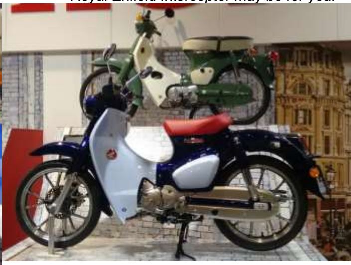
Honda's Cub concept bike was a bit of a "sleeper star" at the show. Keeping very similar lines to the original (which is behind), it's got a single seat and a 125 engine. Build quality looked superb.