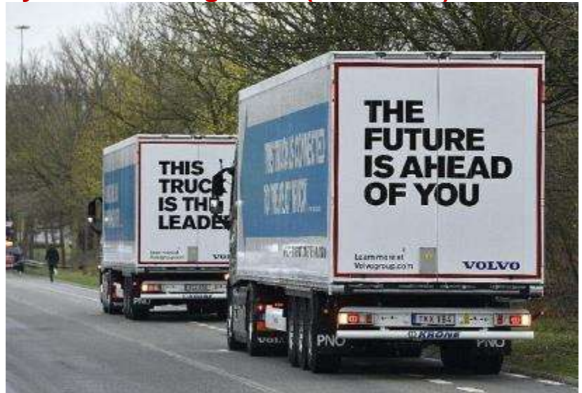
A convoy of robot trucks on test in Holland last April

Initially at least, autonomous vehicles may actually increase congestion on motorways and A roads as computers take a more cautious approach amongst human drivers. Once, however, when they reach a 'tipping point', when there are more robots than people on the road, they will be able to respond more quickly and bunch up more closely, eventually reducing congestion by about 40%. This is contained in the latest proposals from the Department for Transport, which also envisages "platoons of autonomous trucks", driving just a few yards apart, communicating with each other. After a trial in Europe last year, the DfT will