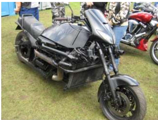
The Brits show those Yanks how it's done! A V12 twist'n'go at a fraction of the price.

Not long now until one of the most friendly, chilled-out rallies on the calendar. "You've Been Nabbed" at Astle Park, Chelford, Cheshire is now in its 24 th year and is still a proper belter. MAG and NABD have always supported each other, many folks (myself included) being members of both. The MAG stand will be there again this year of course, providing help, advice and a refuge from the weather if needs be.