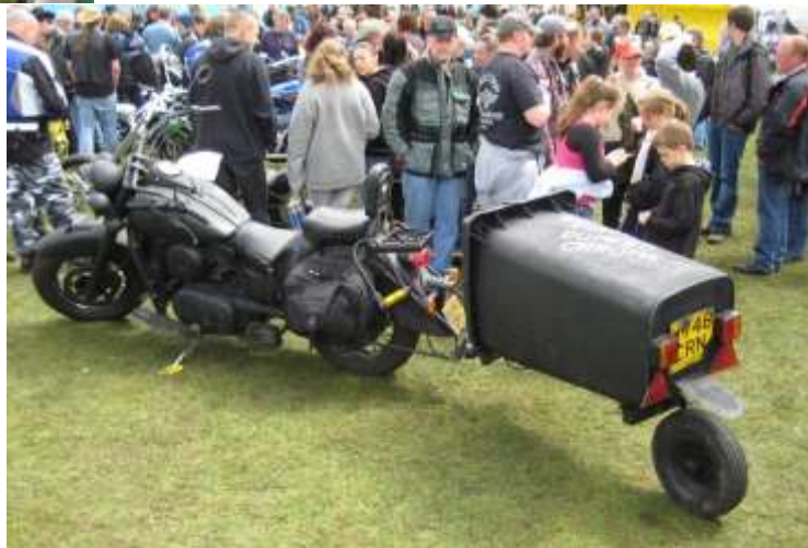
Meeting the latest EU directive on end-of-life: a self-recycling motorcycle.